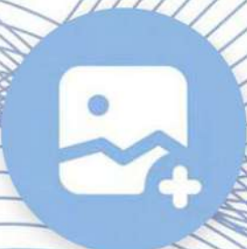
Image insertaion it helps to insert a image through QR code from mobile to whiteboard.